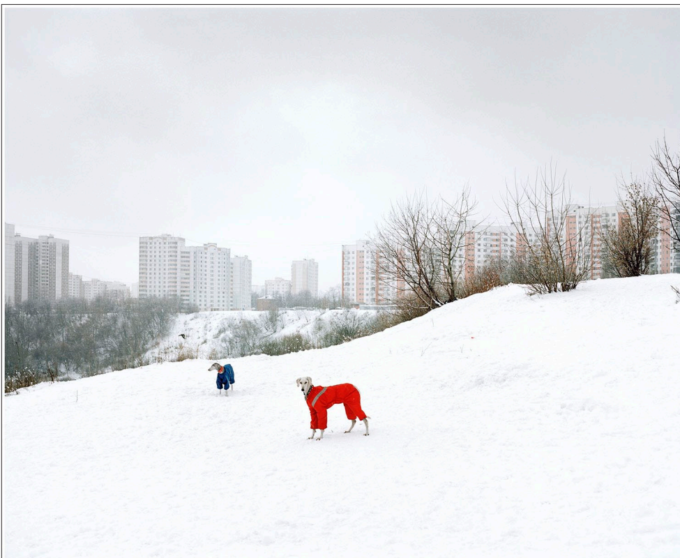
Alexander Gronsky Untitled, n.d., from the series The Edge

Art+Auction, Modern Painters; Artinfo.com, 88.7 FM KUHF; European Photography Magazine; PaperCity Magazine, Culturemap