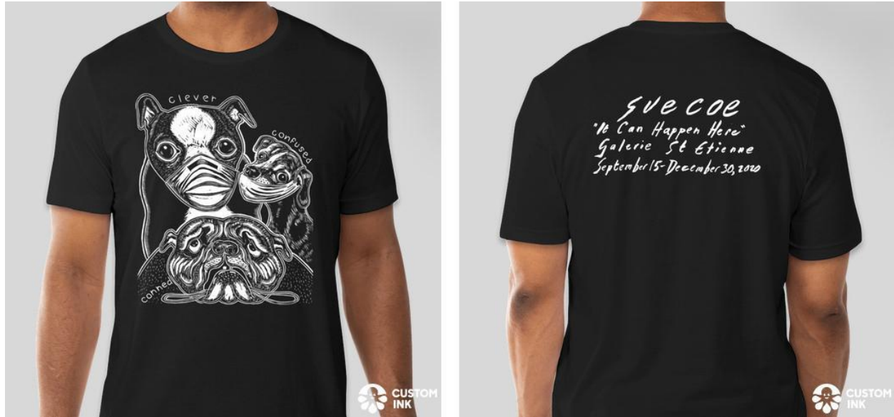
“Political Canines” t-shirt mockup.