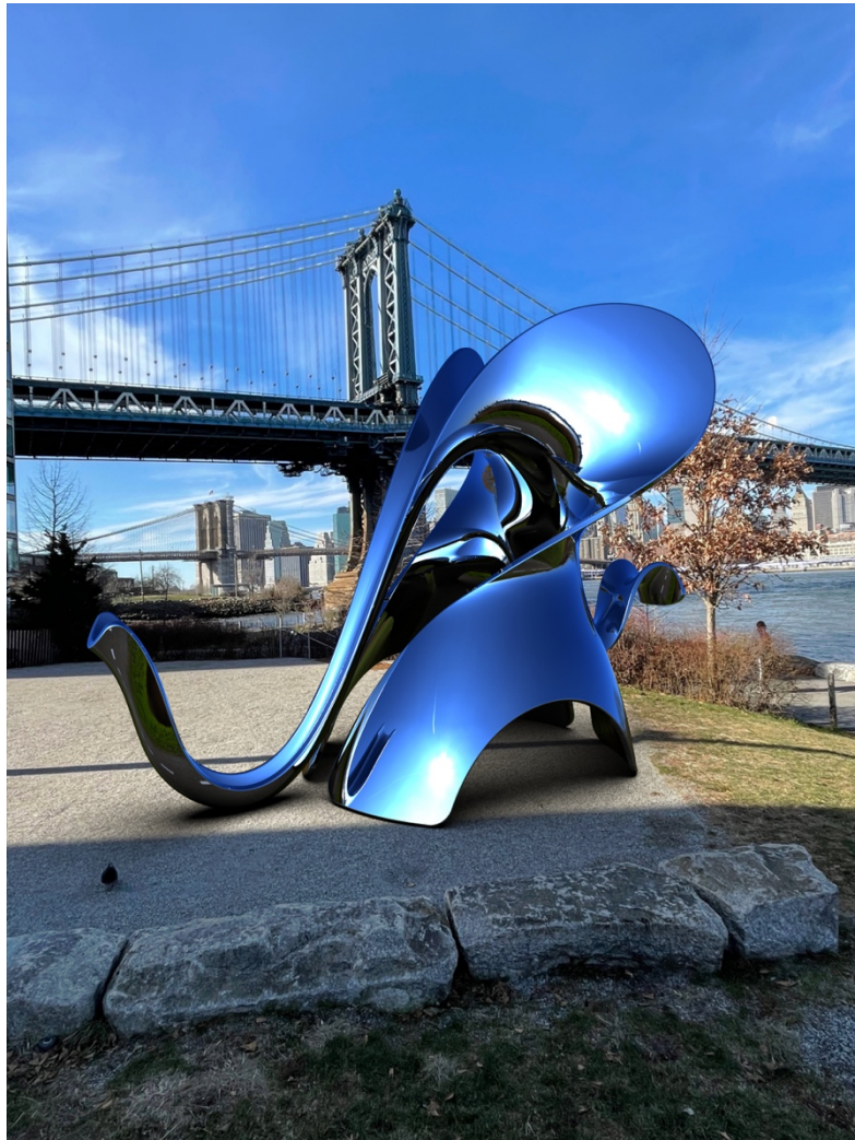
Rendering of ELEPHANTASM

ELEPHANTASM is designed to welcome back the Dumbo workforce community from the lengthy and historic work-from-home COVID-19 era